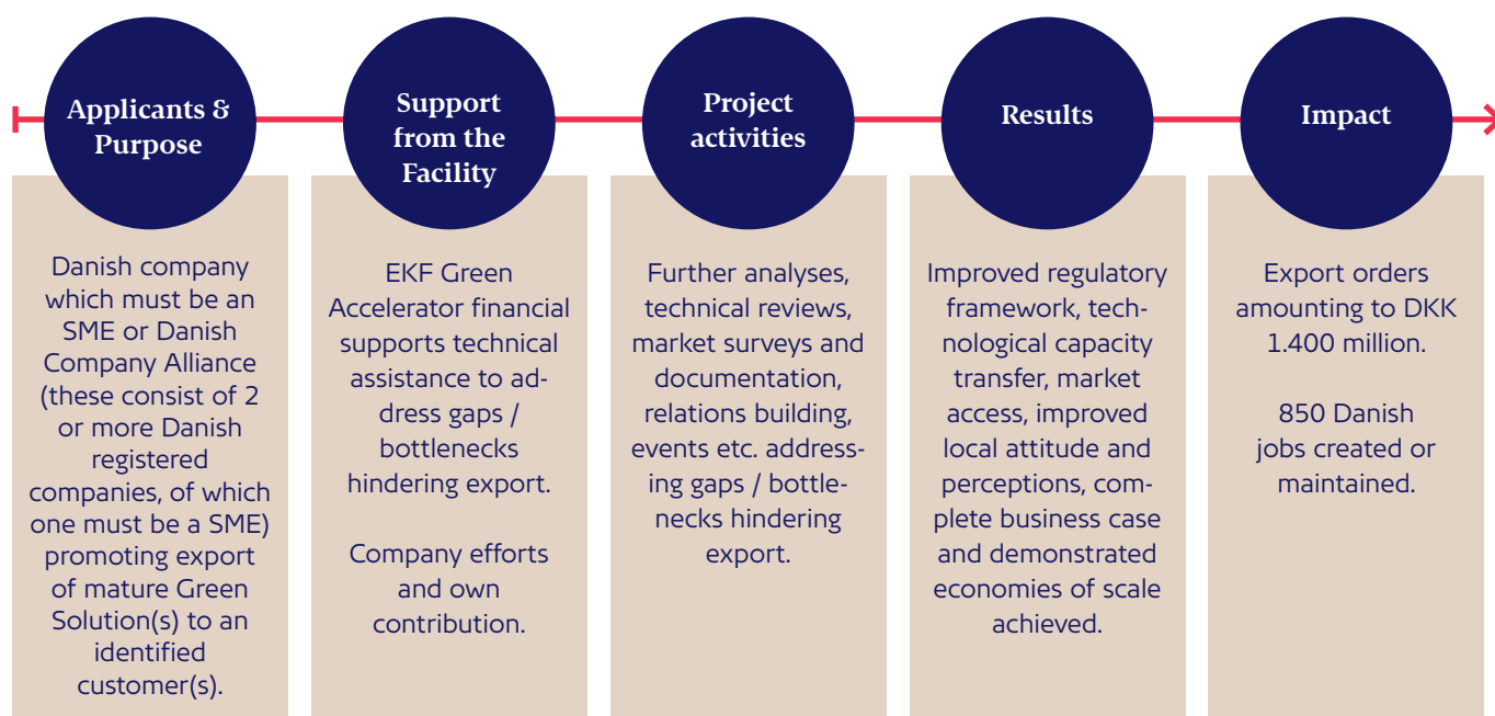
Results Chain of the EKF Green Accelerator

The overall objective of the EKF Green Accelerator is to provide financial support to already mature Danish export solutions, thereby supporting Danish companies in their final push to enter new foreign markets. The expected impact is the attainment of new export orders amounting to DK 1.400 million and the retention or creation of 850 Danish jobs.